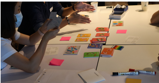
Design Thinking GAMIFIED