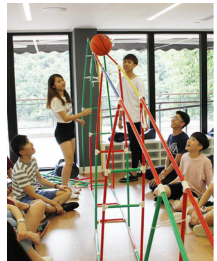
Bridge The Gap