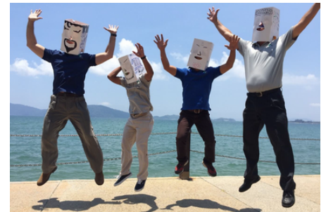
BOX ON / BOX OFF