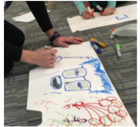
Illustrate the various boundaries of our thinking and map them to a physical box.