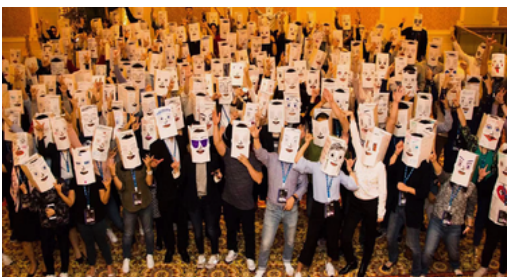
Thinking in and out of The Box